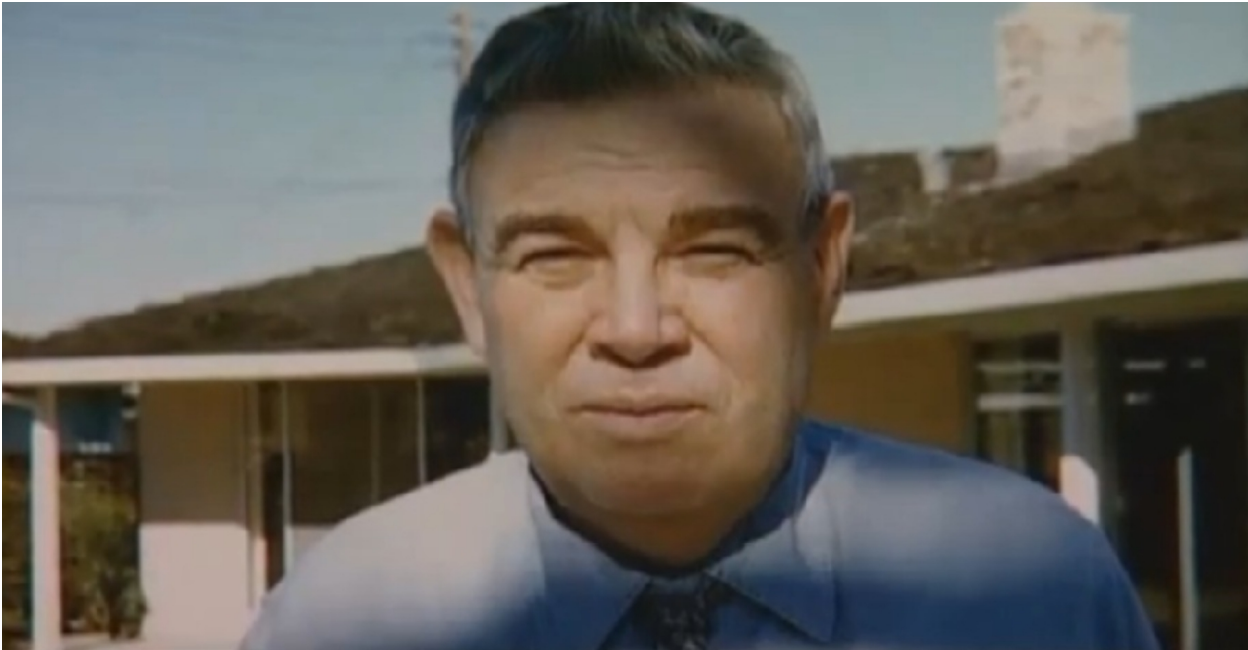
The only available color photograph of Captain Alfred M. Hubbard